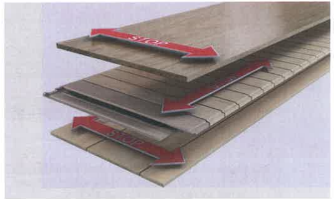
Fig. 1. Cross structure of 3-layer wooden floorboard produced by Barlinek Inwestycje Sp. z o.o.

Barlinek floorboard is made from three layers of real wood arranged in a cross structure (Fig. 1) in order to prevent swelling, squeaking or drying out causing splits. The cross construction reduces natural tension and compression of wood, provides a balance between the layers of the board, and thus guarantees the stability of the floor. The Barlinek floorboard's layered structure is suited for underfloor heating. The floorboards are joined using 5Gc joints and Barclick (Fig. 2) which allow to lay the floor without most of the tools which are usually necessary to install a floor. Specification of the product is shown in Table 1.