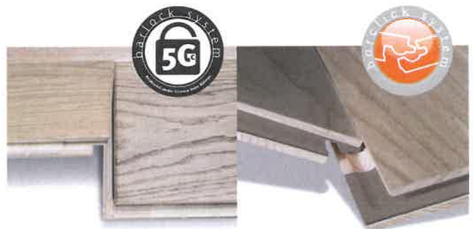
Fig. 2. Views of Barlinek floorboards with 5Gc BARLOCK and BARCLIK systems